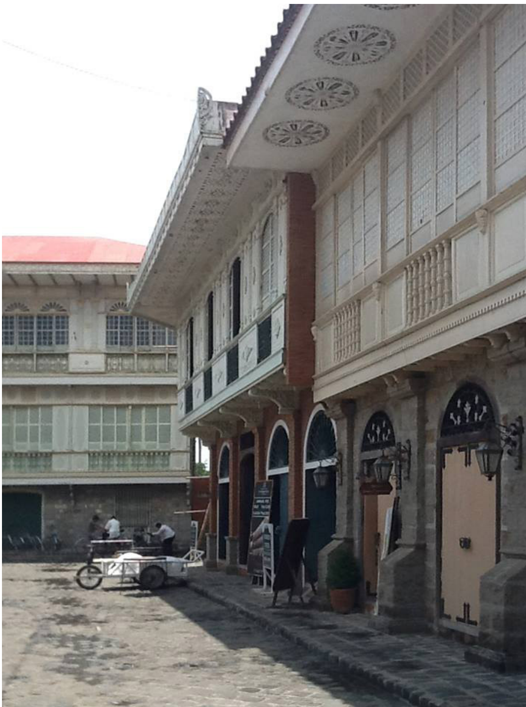
Vented soffits can be ornamental as well as functional.

low the main windows — let air in even when the capiz panels are drawn (e.g. at night). In some houses, voladas (perimeter passages) are also provided, allowing air to circulate around, and cool, the house. (They also permitted servants to circulate from room to room without disturbing the master's family in the main living spaces. Some voladas were larger, allowing the women to “paseo”, promenading indoors/walking the perimeter of the house while chatting.) Overall, this comprehensive system, while low-tech, allows full control of the amount of light and air entering the house.